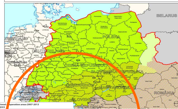
Transnational cooperation areas 2007 - 2013 Alpine Space